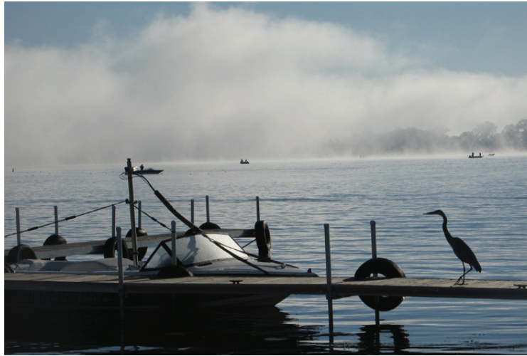
READYto Ski?

WHEN RUSH is hurried to the nearest hospital after his heart gives out again, him and his family won't refuse treatment and board a plane to Costa Rica because it was all a sham in theatrics. Fear and theatrics is how the right will try to stamp out Obama, but for now I can enjoy being added back to that insurance plan I just got